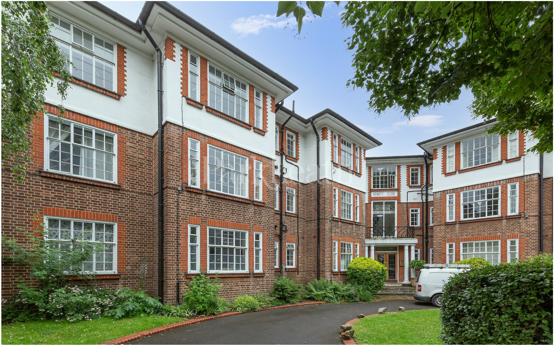
Howitt Close NW3